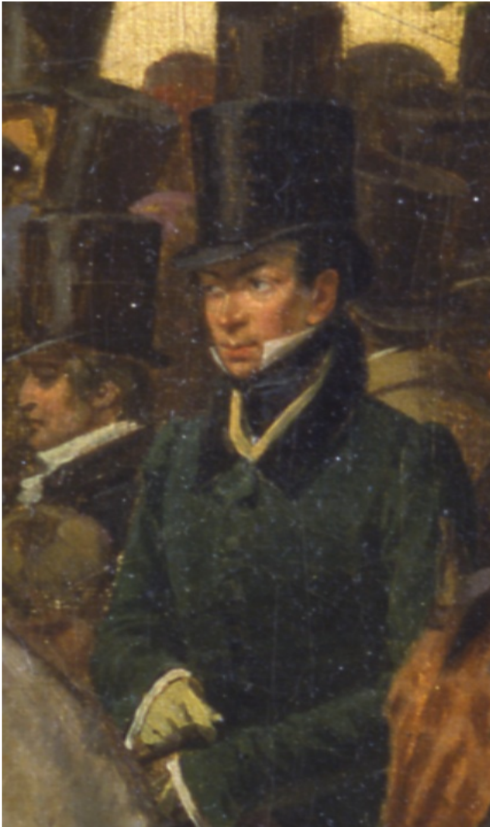
Detail from: Franz Krüger, Parade at Opernplatz 1824, Berlin, Staatliche Museen SPK, Nationalgalerie