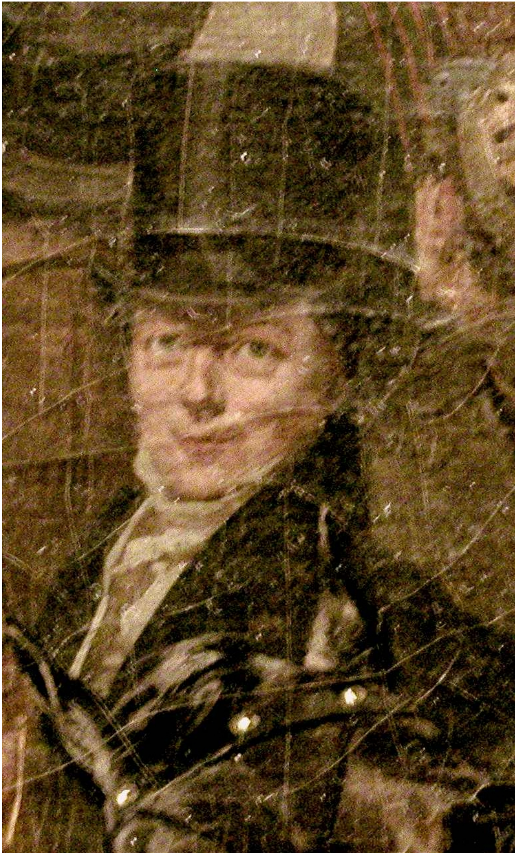
Detail from: Franz Krüger, Parade at Opernplatz 1824, Berlin, Staatliche Museen SPK, Nationalgalerie