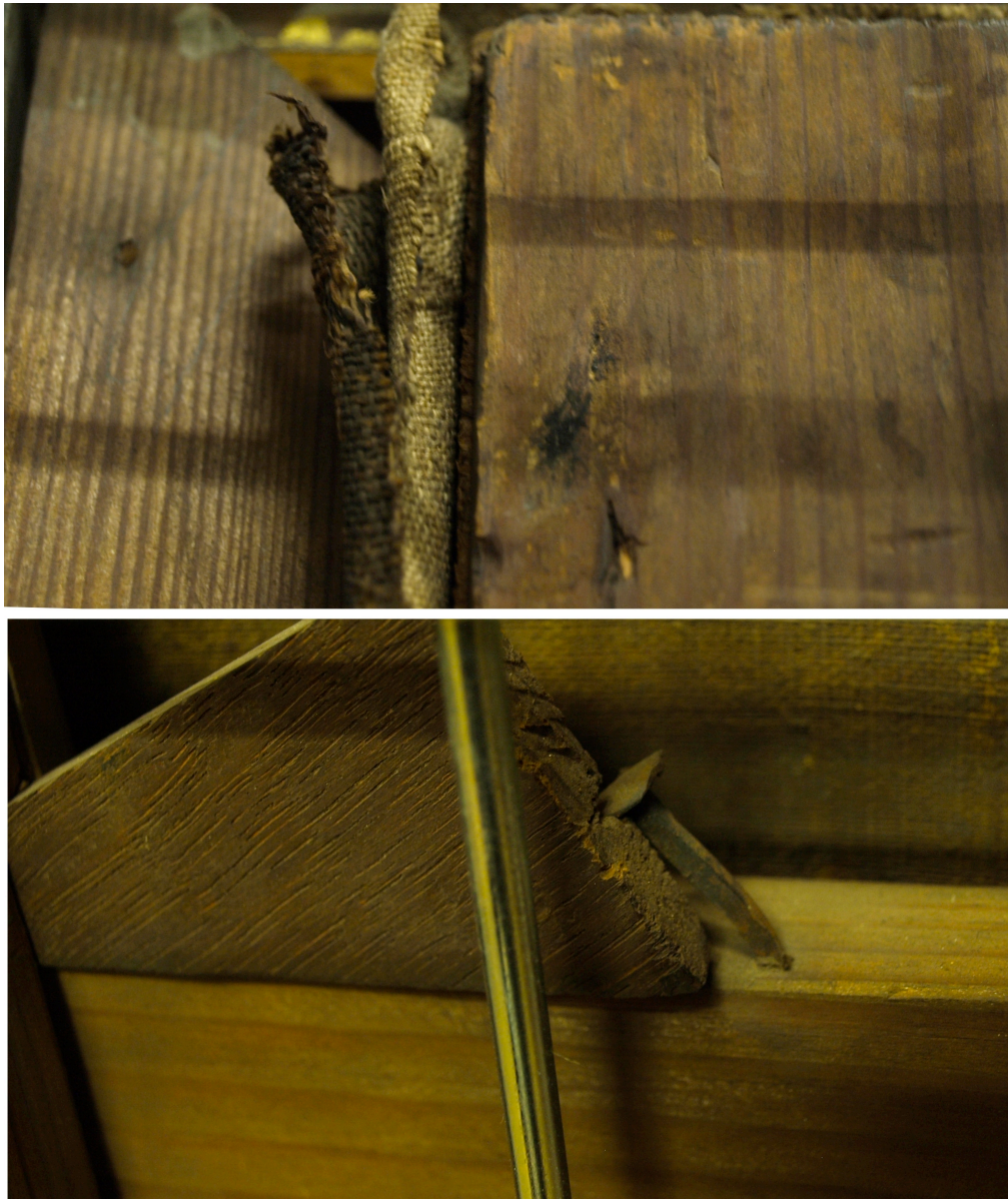
Doubled canvas and stretcher frame presumably from Bock's restoration before 1815