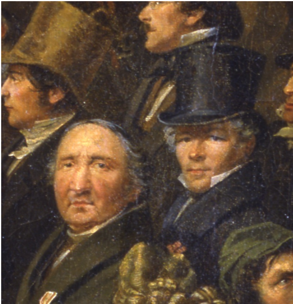
Detail from: Franz Krüger, Parade at Opernplatz 1824 , Berlin, Staatliche Museen SPK, Nationalgalerie