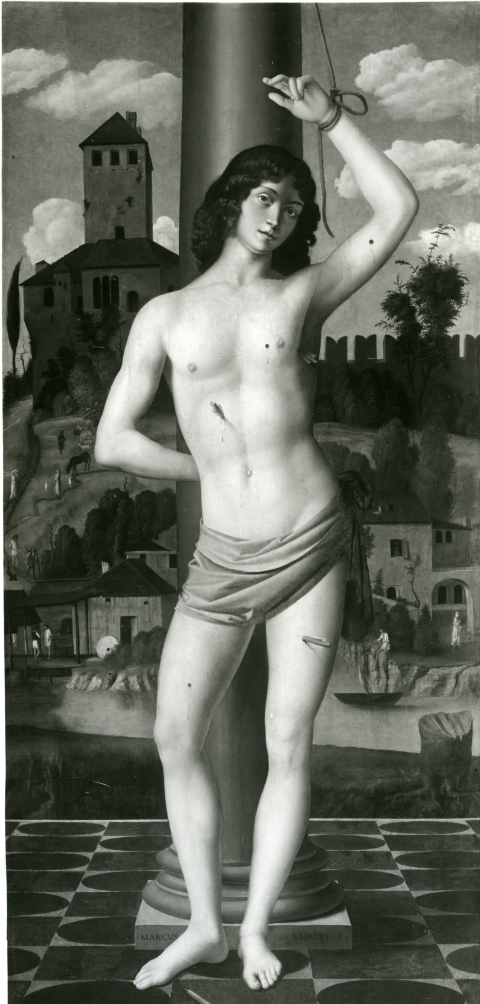
Fig. 7 Marco Basaiti, Saint Sebastian