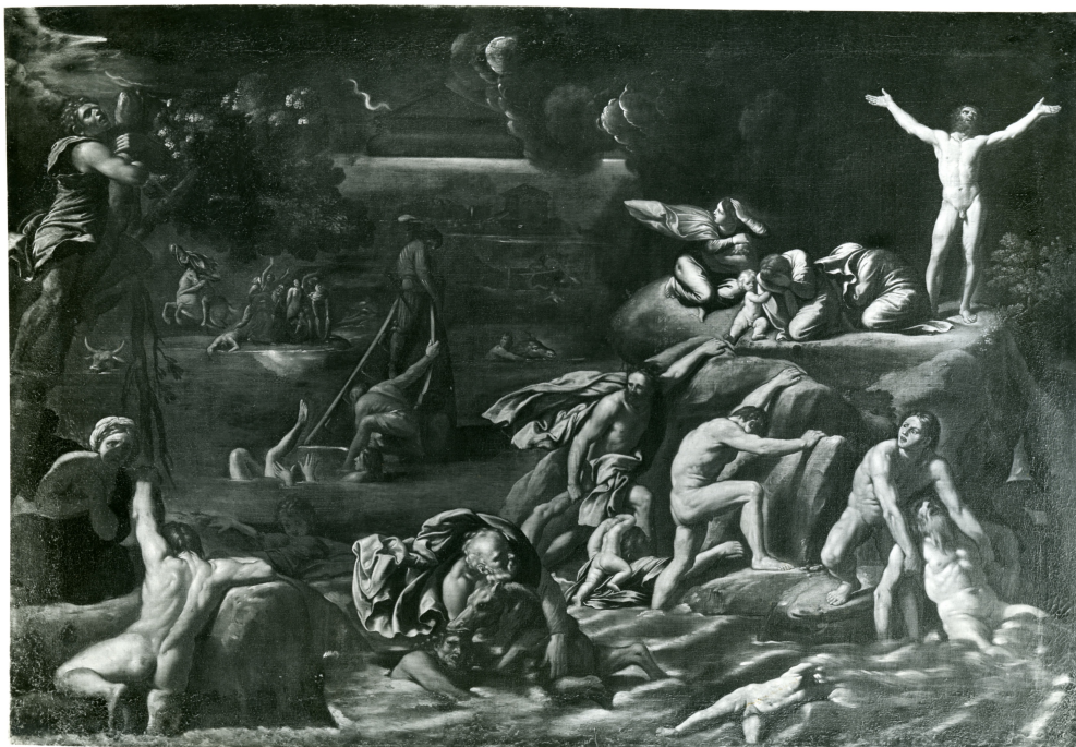
Berlin, Gemäldegalerie, Staatliche Museen zu Berlin Preußischer Kulturbesitz