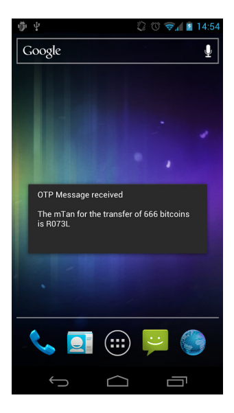
{\bf Fig.\,6.} \ {\bf The\ OtpMessages\ Application\ receives\ an\ SMS\ containing\ an\ mTAN\ OTP.}