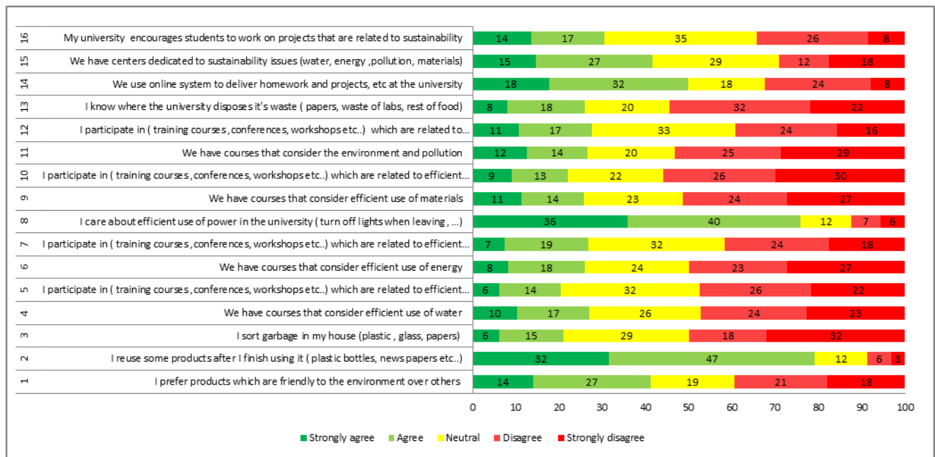
Figure 3: Results of each question in the students' survey

The analysis of the questions related to students' practices and observation at the University is summarized in details in Figure 3. The general portrait shows low awareness in most of the issues they were asked to respond except the issue regarding the reuse of some of the consumable products (point 2) which is a practice that may be attributed to the lack of physical resources and its associated costs. The other exception was related to ethical behavior to do with culture (point 7) as people are trying to save money and reuse whatever they can.