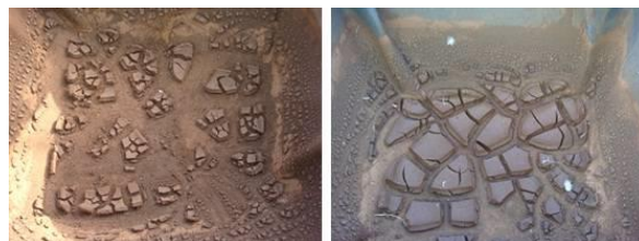
Figure 5: Conditions on the seventh day of sludge in the essay number 1 in the covered DB (left side) and in the uncovered DB (right side).

Figure 5 shows a comparison between the conditions of sludge on the seventh day from the assay number 1, which allows to visually realize the superiority of water removal from sludge and consequent reduction of volume in the covered drainage bed in relation to the uncovered one.