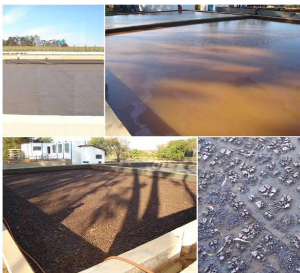
Figure 3: DB Guaíra WTP: DB empty, DB filled with WTP sludge, WTP sludge dewatered, zoom in WTP sludge dewatered [7].