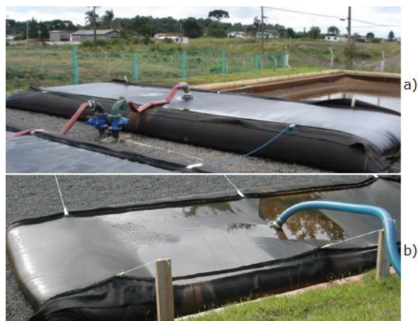
Figure 2: a) Curitibaanos WTP – Santa Catarina State, and b) Santo Antônio do Jardim WTP – São Paulo State [7].

Figure 2 illustrates two cases of application of this system for dewatering WTP sludge in Brazil.