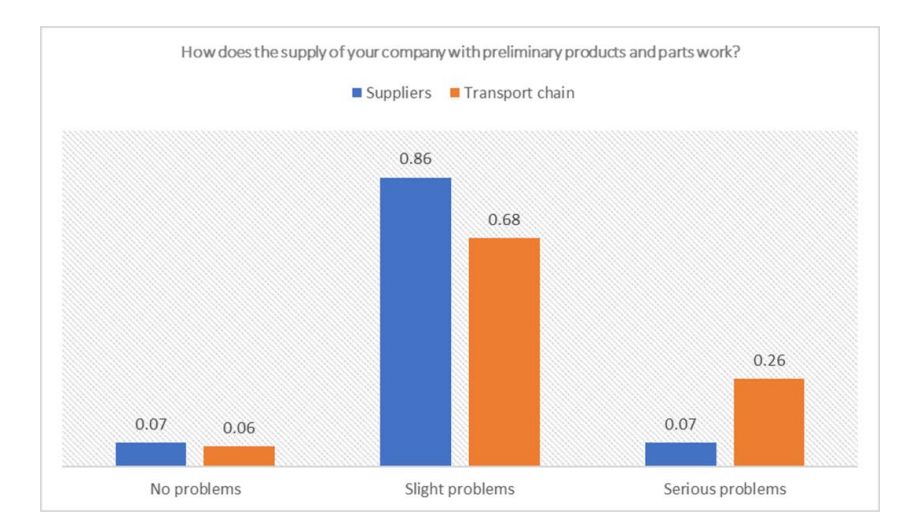
Figure 2. Impact of the COVID-19 crisis on the supply chain at the end of April 2020. (Multiple answers possible, answers weighted by turnover, own illustration data from [27].)

Figure 1. Impact of the COVID-19 crisis on orders in April. (Multiple answers possible, answers weighted by turnover, own illustration data from [26,27]).